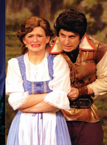
Disney's Beauty and the Beast 2007