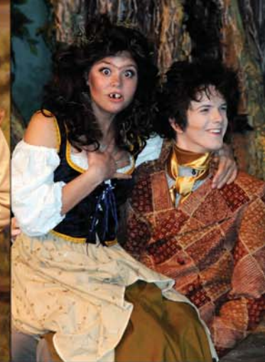
As You Like It 2008